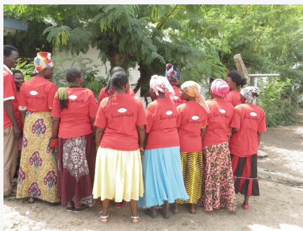
Above: Active MF members with T-shirts inscribed with "Balozi wa macho", which translates to "the ambassador of eye care activities".

In Mara Region, an evaluation and re-training of the MF members allowed the women to share their experiences and success stories from working in the field. Members agreed that the refresher training was valuable as they continue to refer patients to outreach camps and the Regional Referral Hospital.