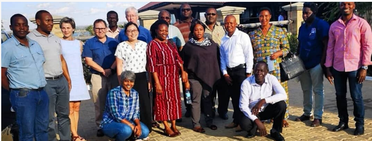
Above: Participants from the Global Sight Initiative supported programs gathered in Singida, Tanzania for a cross-learning meeting.

KCCO also completed a number of consultancies in 2019 to assist international foundations and non-governmental organizations with the design, implementation and evaluation of eye health programs. Through its ties with graduate training activities at the University of Cape Town, there was an increased focus in 2019 on diabetic retinopathy and diabetic management systems (see Research and Evidence, page 10).