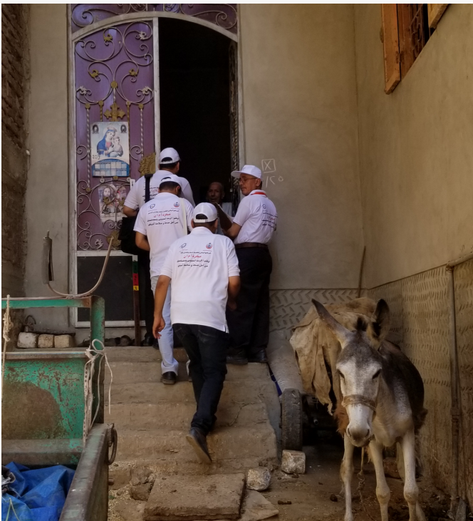
Above: A team of community drug distributors visit a household in Egypt, under the watchful eye of a donkey.

With funding from Sightsavers International, KCCO and the International Trachoma Initiative (drug donation program), a Mass Drug Administration (MDA) campaign with Zithromax® was conducted in the district of Matai in Egypt. The campaign was a success, thanks to the leadership of local health authorities and the Nourseen Foundation as a local implementing partner.