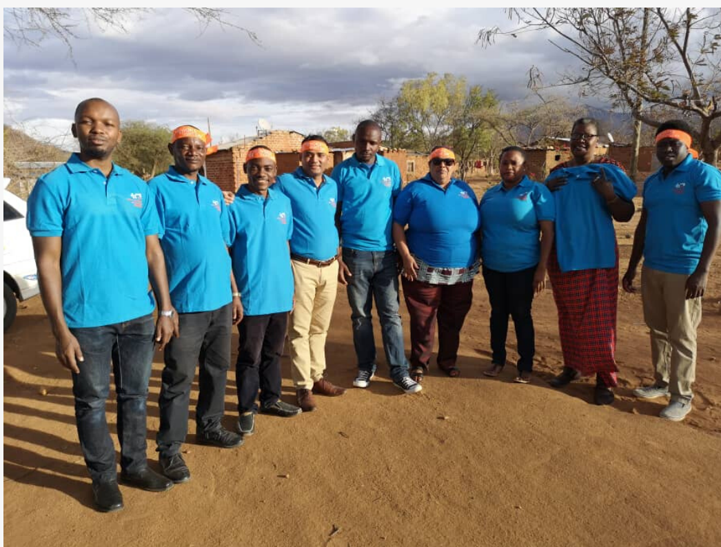
Above: KCCO and Seva Foundation representatives together with the Dodoma team during an outreach on World Sight Day in October 2019.