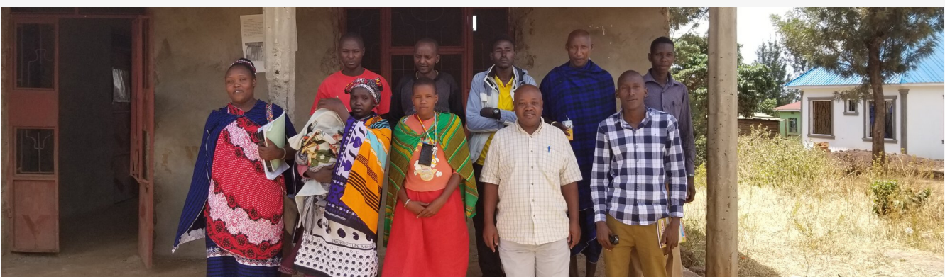
Above: Project on equitable access to MDA- Focus group participants in the district of Longido in Tanzania.